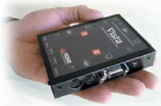
Vista-mini has Hi resolution video and stereo audio

Call us for more information on this excellent family of full-featured, easy-to-use, and economical KVM switches.