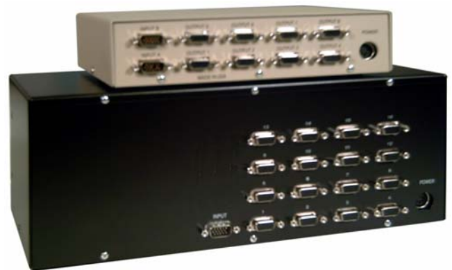
VSP-2X8VB model (top) / VSP-1X16VB model (bottom)

■ Phone: 281-933-7673 ■ E-mail: sales@rose.com ■