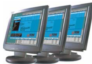
Drive multiple monitors From 1 or 2 computers

The VideoSplitter is rack mountable with optional 19", 23", and 24" rack mount kits.