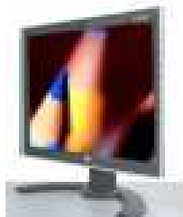
Display your VGA video On a DVI monitor