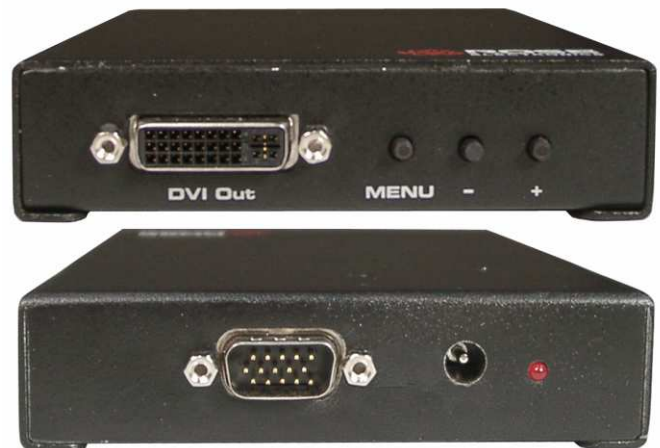
Front / Rear view