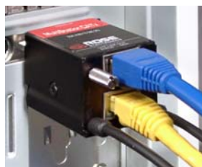
Connects directly to a PC's Video, keyboard, and mouse ports