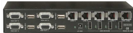
Receiver With auxiliary USB Keyboard input