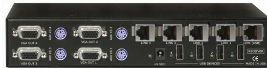
Receiver With auxiliary PS/2 Keyboard input

NOTE: Aux keyboard input (USB or PS/2) are for video adjustments only.