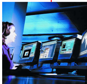
View single, or dual, video 1,000 feet away

The bi-directional serial option allows you to connect a touchscreen, digital tablet, serial printer or other supported serial device to the remote location. No set-up is needed; just connect the serial device to the serial port and it's ready to use.