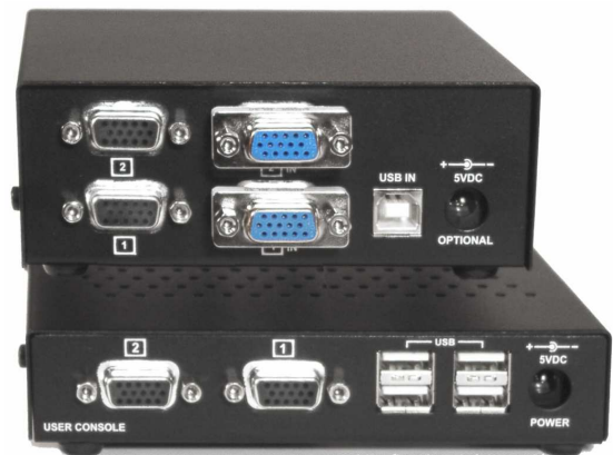
Rear view Local / Remote units Dual Video

■ Phone: 281-933-7673 ■ E-mail: sales@rose.com ■