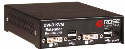
Rear View single Link – dual Video – USB 2.0

■ Phone: 281-933-7673 ■ E-mail: sales@rose.com ■