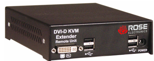
Rear View single / dual Link – single Video – USB 2.0