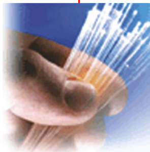
Fiber makes extended distances easy to reach

All models are available with both transmitter and receiver KVM access. The transmitter's KVM access allows an additional KVM station to be connected to the transmitter unit. If your system requires dual video, the CrystalView DVI Fiber dual video model can fully support it.