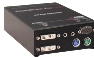
CrystalView DVI Fiber (PS/2 model)