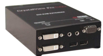
CrystalView DVI Fiber (USB model)

■ Phone: 281-933-7673 ■ E-mail: sales@rose.com ■