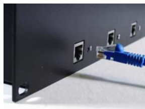
Standard CAT5 connectors

Presentations, slide shows, schedules, and other types of common information can be centrally generated and displayed simultaneously on all remote monitors. The serial and audio models can distribute these signals to the remote stations.