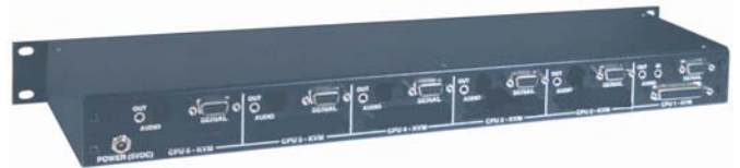
Rear View (Serial/Audio model)

■ Phone: 281-933-7673 ■ E-mail: sales@rose.com ■