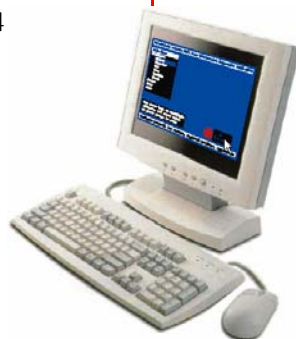
UltraMatrix on-screen menu

The UltraMatrix provides serial support to access computers, routers, Ethernet hubs, UNIX devices and more. It can perform as a "VT220" color terminal emulator with an eight-page scroll buffer. Local monitor connection, security, flash memory, system status, and a long list of other features ensure the UltraMatrix will streamline your data center or server room. Call us for more information on this and other excellent Rose products,