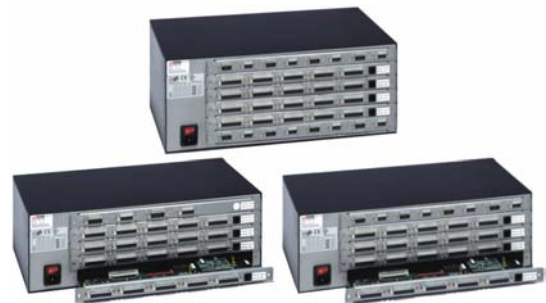
Rear View UM4-4X16U/E UM16-4X16U/E2 UM8-4X16U/E

■ Phone: 281-933-7673 ■ E-mail: sales@rose.com ■