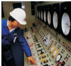
Connect up to 9 peripherals

The units can be daisy-chained for expansion. The versatility of the SuperSwitch makes it a practical investment for the budget-conscious.