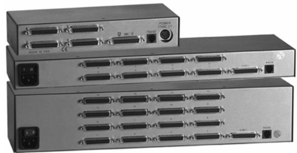
Rear view models : SPM-4UB / SPB-8UB / SPC-16UB

■ Phone: 281-933-7673 ■ E-mail: sales@rose.com ■