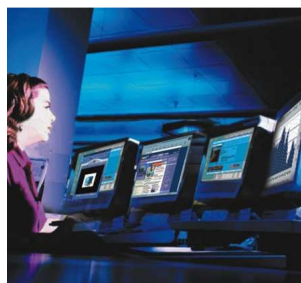
Independent or simultaneous switching of KVM and peripherals

The MultiVideo DVI can be connected to an additional unit and synchronized to switch video from multiple computers. When a switching command is sent to the master unit, it sends the same switching command to the secondary unit. Both units are switched to the same CPU port and video is displayed on all of the connected monitors.