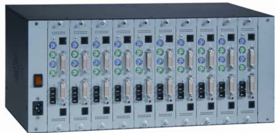
Rearview - 10 module rack

■ Phone: 281-933-7673 ■ E-mail: sales@rose.com ■